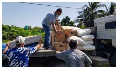
Arrival of Food for Cuban Families

essential food and humanitarian supplies to Cuba. Because of your generosity, we were able to purchase and send nearly two full 40-foot containers of food to Cuba. We partnered with others in the USA who had received special permission to quickly send those goods. To date, in total 7 containers have landed and been distributed, 3 are in port in Jamaica awaiting shipment to eastern Cuba, 2 more containers are on the water, and 3 are being loaded in Texas. So let us pray that the power of God will speed these remaining containers into the hands of the Cuban churches and people before this Christmas. Thank you again for being the hands of God to these precious brothers and sisters.