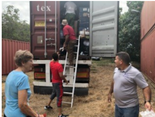
Container Arriving in Cuba!