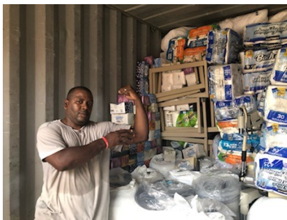
Container Being Unloaded

Our next major, and ongoing area of ministry is underway, with the commissioning of the fabrication of the steel forms for our water filter manufacturing and distribution project. God willing, we hope to see our new ministry in operation during our Fall trip.